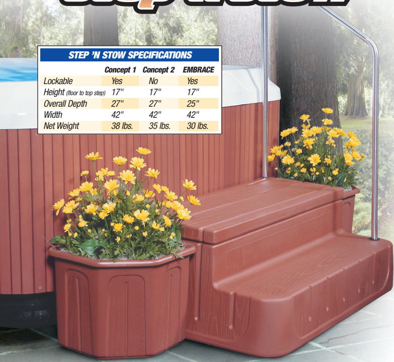
Step 'n Stow Concept 1 shown in Light Redwood with optional Hand Rail and Planters